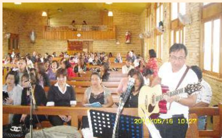
CFC in action...