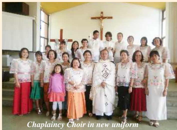
Chaplaincy Choir in new uniform